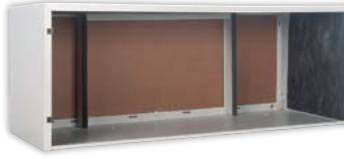
Deep wall sleeve extension PDXWSEXT18 shown with weather panel in place