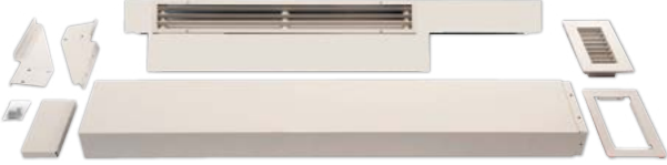
PDXDAA and PDXDEA ship together